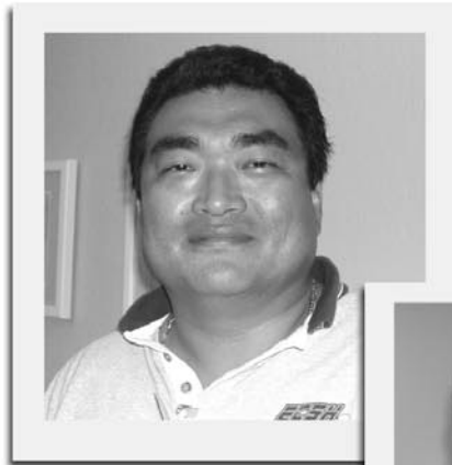
New Pinellas County Judge Sonny Im